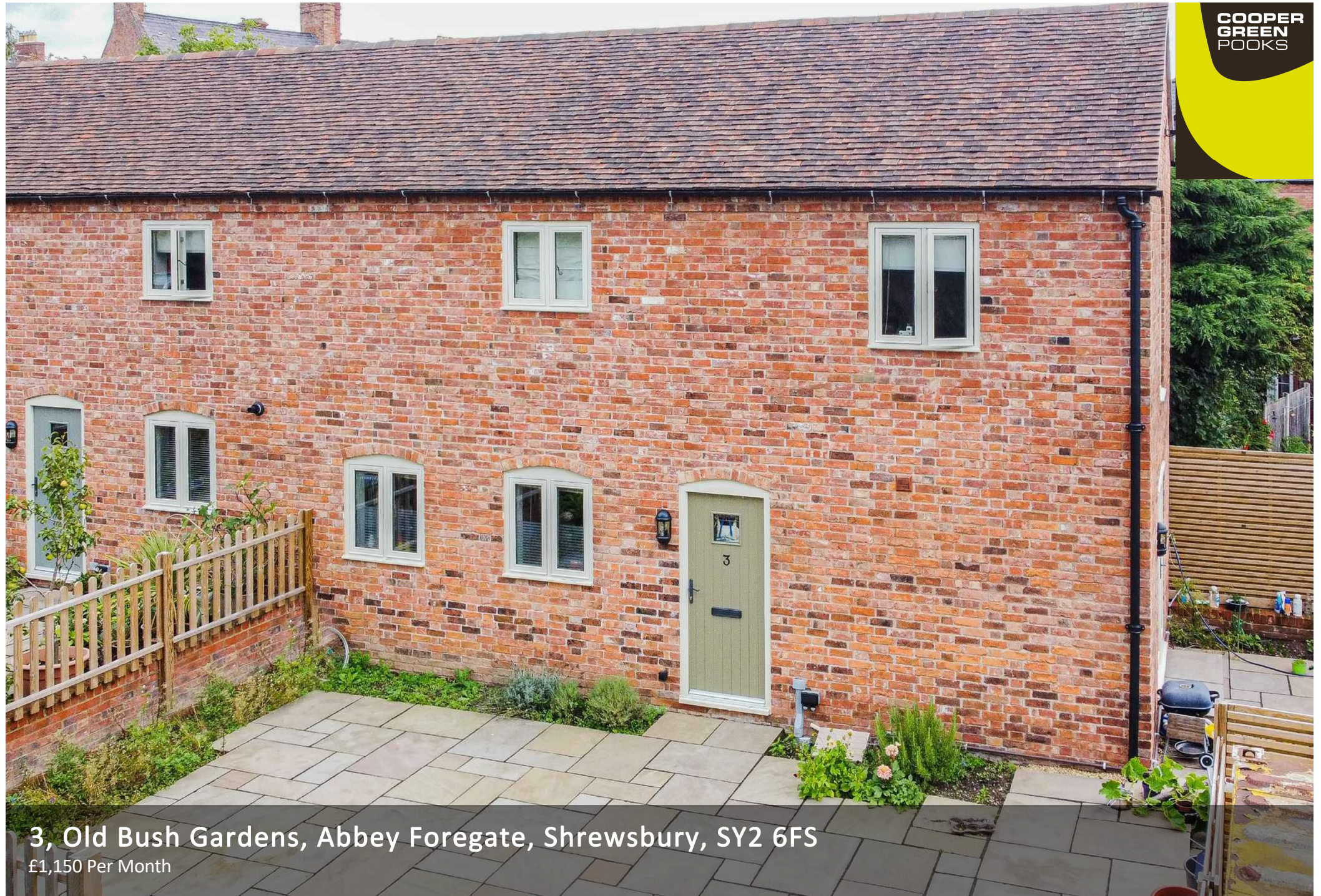
3, Old Bush Gardens, Abbey Foregate, Shrewsbury, SY2 6FS £1,150 Per Month